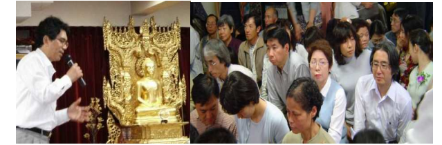
NIFJ Chapter President thanking the mass assembly praying for world peace.