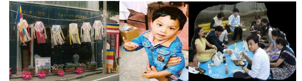
Buddhist lanterns. Our youngest participant joining free meal with NIFJ members.