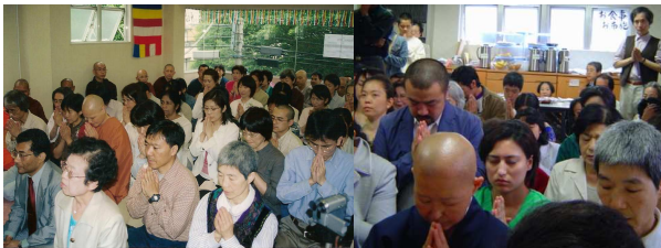
Japanese, Myanmar, Sri Lankan and Nepalese at offering worship to Lord Buddha

The first joint Vesak Festival was organized in collaboration with Japan Theravada Buddhist Association (JTBA), and several participating organizations including Nepalese Association of Japan (NAJ), Non-resident Nepalese Association (NRN)-Japan, Milan Club (MC), Sri Lanka-Nippon Budo Association (SNBA) and Japan-Sri Lanka Cultural Exchange Association (JSCEA) at the initiative of Newa International Forum Japan.